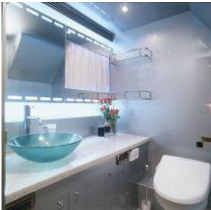
Port Twin Bath