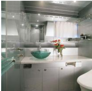
Stbd Twin Bath