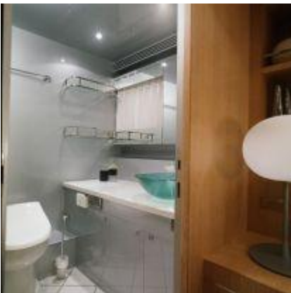
VIP 2 Bath