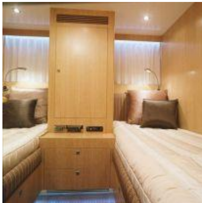
Crew cabin #1